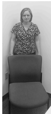
Example of safe position for standing exercises