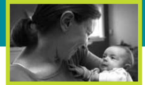
Figure 1 The Gap in Children's Language Ability Begins Early